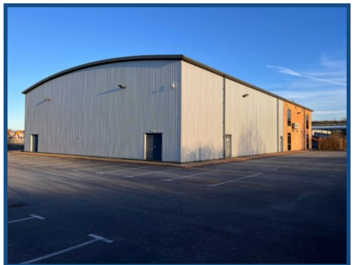
External View From Rear

E: garry@woodmoore.co.uk M: 07790 831915