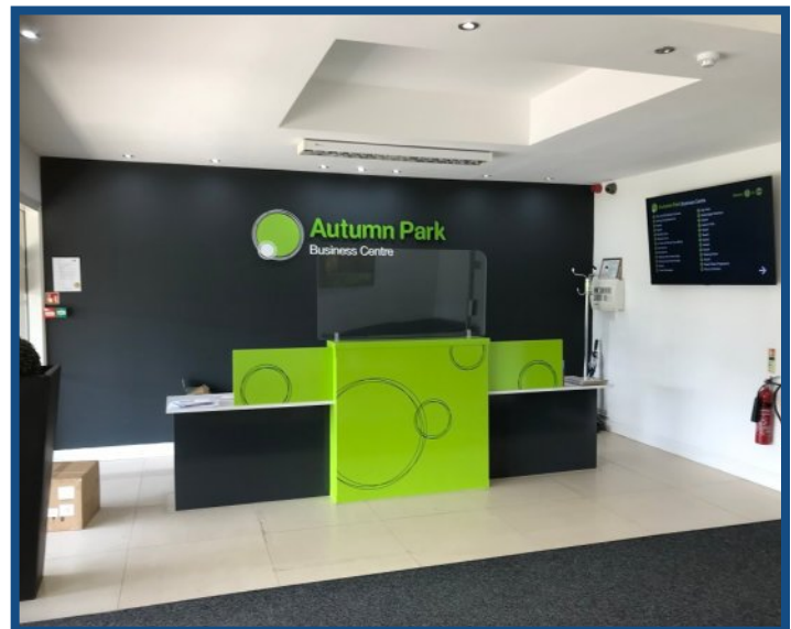
Internal View of Reception