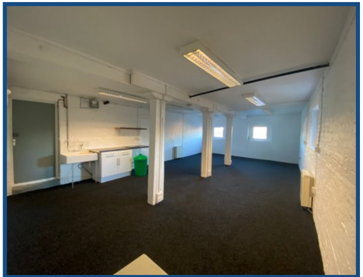
Internal View of Property

For further information including plans & drawings, or to arrange a viewing, please contact our offices directly on: 01636 610906