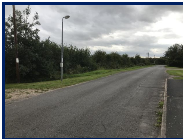
View of site from Vicarage Lane